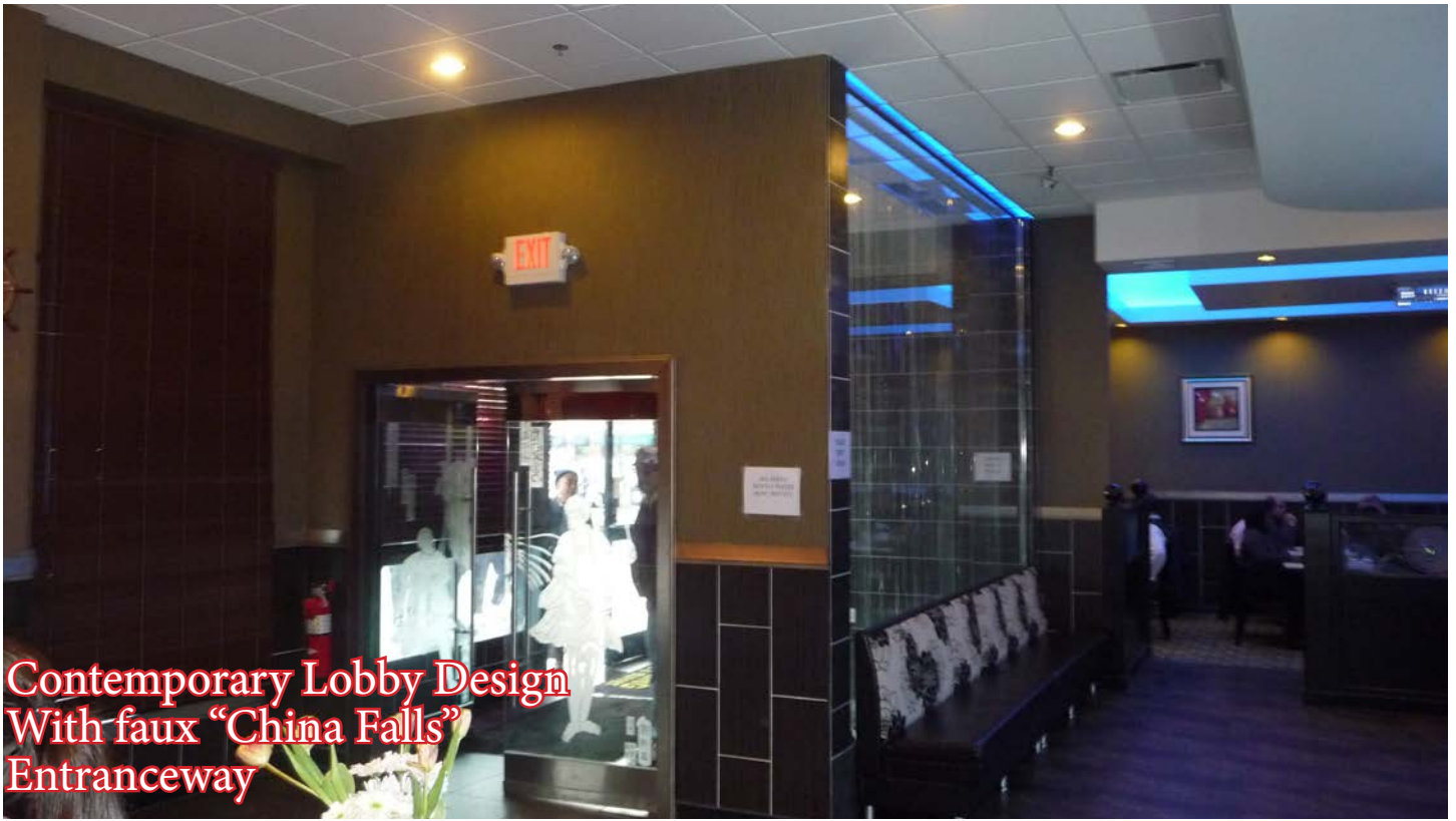
Contemporary Lobby Design With faux "China Falls" Entranceway